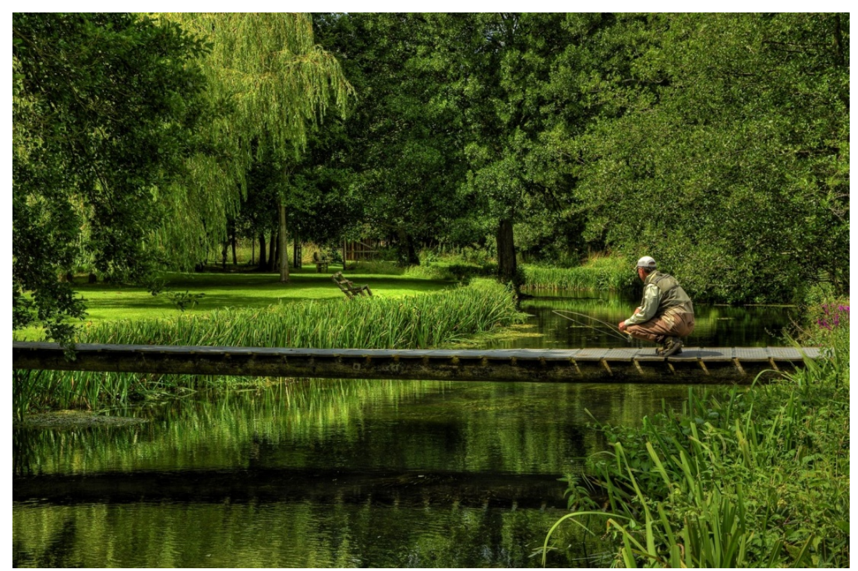
Upstream to the footbridge

However, the fish are not always easy to spot at Dunbridge. The dark bottom combined with more depth than you might expect (we are caught out sometimes when weed cutting!) means it is tempting to pass by spots you might otherwise regard as fishless.