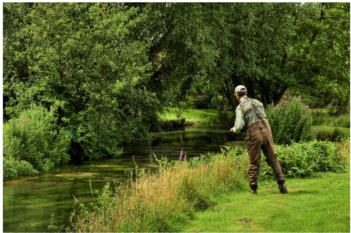
A few yards up from start of the beat

Downstream of the wooden footbridge: Cross the footbridge to the opposite bank; the end of the beat is a concrete bridge with a steel handrail which is about 75 yards downstream. The best way to reach the start is on foot; cross the wooden footbridge in the garden, turn right downstream until you reach the concrete bridge.