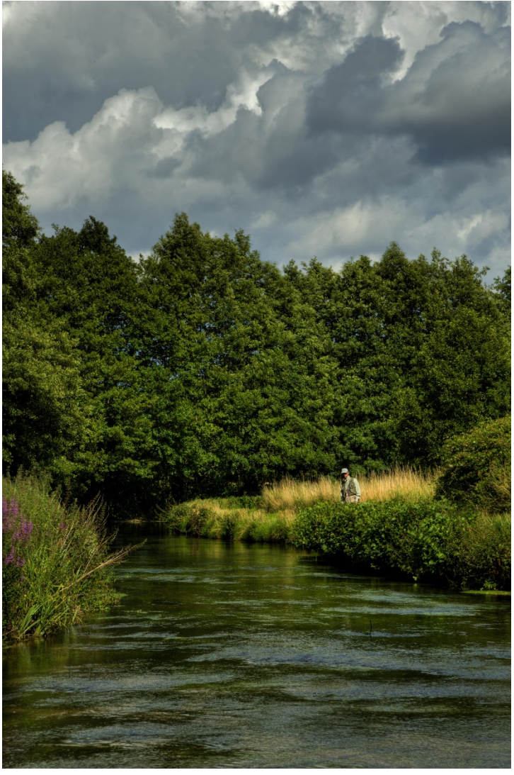
Looking down to Rickety Bench pool

sharp bend that turns to the left, with a rickety bench on the corner of the pool - this is a great spot.