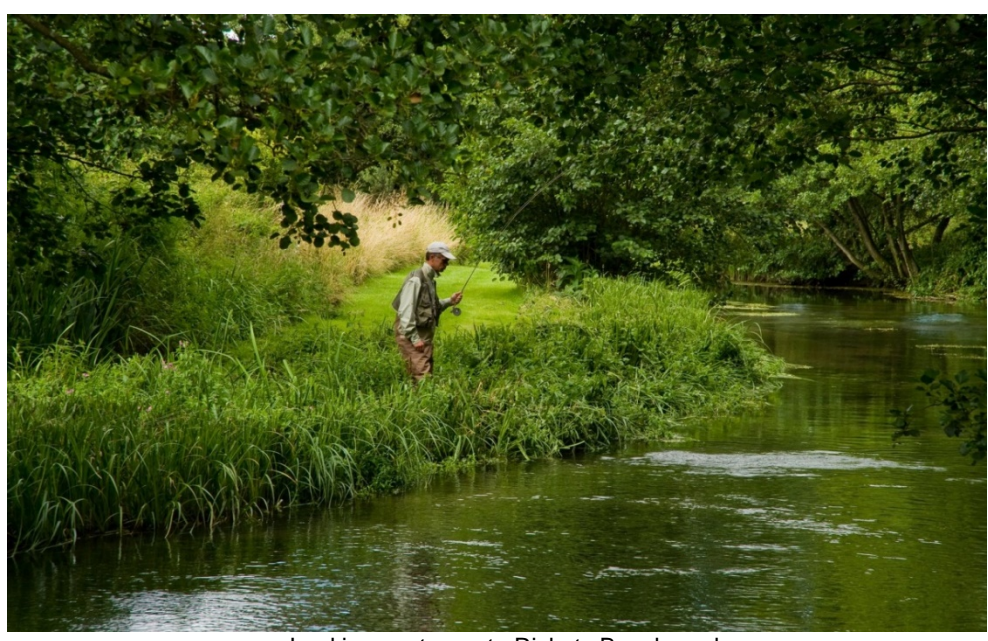
Looking upstream to Rickety Bench pool

To this point when there is no surface action lightly weighted nymphs will prove very effective. It is worth remembering that some of the bends are very deep, as much as 4-6ft so try a long tippet and let the nymph go deep and knock along the tree roots. Unfortunately, you will get snagged from time-to-time, but the rewards can be worth the risk.